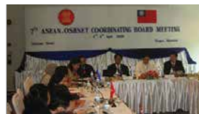
7 th CBM Yangon, Myanmar April 2006