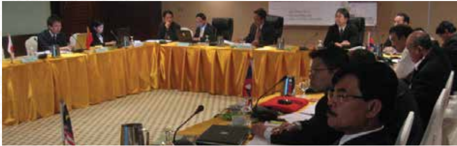
2nd ASEAN-OSHNET Plus Three Policy Dialogue on OSHMS held in Kuala Lumpur, Malaysia, in December 2008.

Small and Medium Enterprise (SMEs) form the bulk of economies and are usually the most vulnerable as they have the least resources to manage safety and health issues. Hence the ASEAN-OSHNET was concerned with the safety and health standards in SMEs.