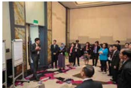
LEFT: ASEAN-OSHNET members touring Singapore after the policy dialogue. RIGHT: Break-out Session at the policy dialogue.