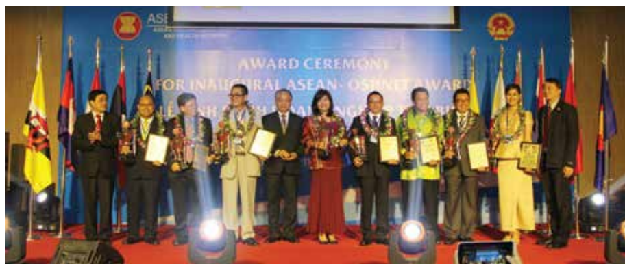
ASEAN-OSHNET Excellence Award Winners receiving their awards on 27 April 2016 in Da Nang, Vietnam.

ASEAN-OSHNET needs to continue to enhance OSH standards, performance and capabilities in ASEAN. ASEAN-OSHNET must respond to the evolving business environment and emerging technologies by keeping up to date with the latest OSH developments and constantly reviewing existing OSH practices and standards so that they remain relevant. ASEAN-OSHNET should also help member states develop and maintain robust OSH frameworks through the sharing of common OSH challenges and solutions.