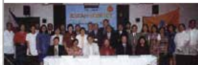
5 th CBM Chiang Mai, Thailand April 2004