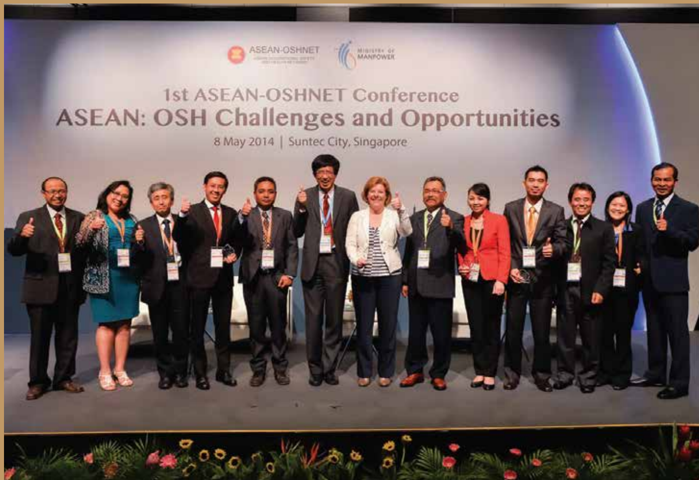
Delegates at the 1st ASEAN-OSHNET Conference in Singapore in May 2014.