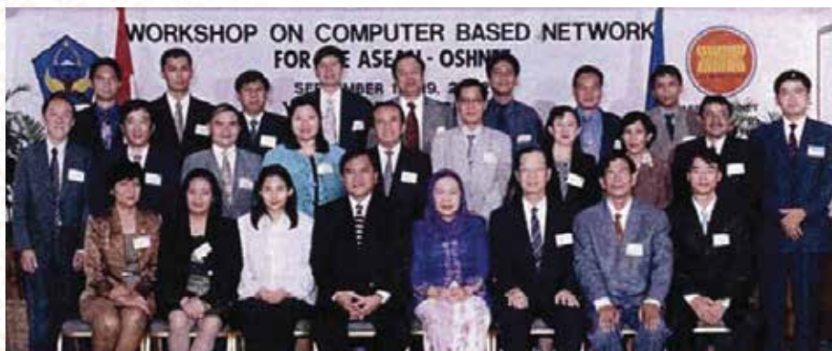
The workshop on Computer-based Network for ASEAN-OSHNET was held in Yogyakarta, Indonesia, in September 2002.