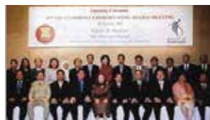
4 th CBM Singapore July 2003