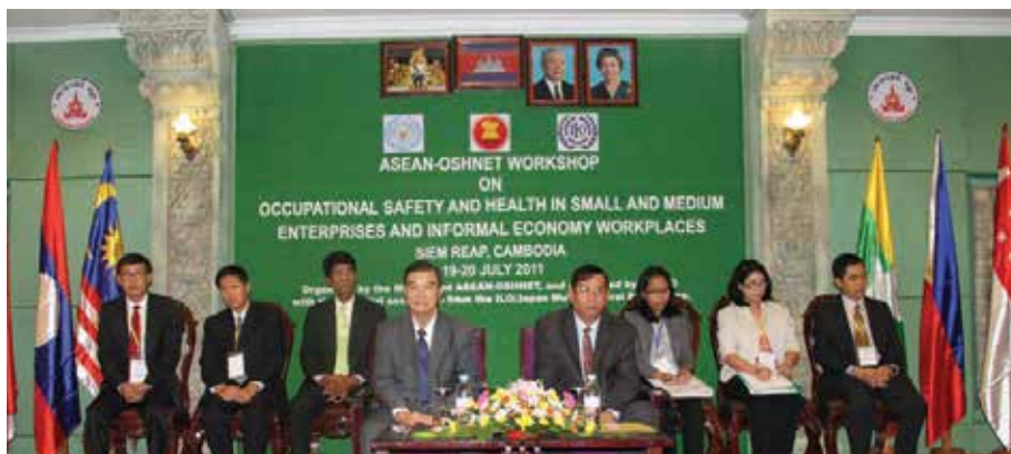
Delegates at the ASEAN-OSHNET Workshop on OSH in SMEs and Informal Economy Workplaces in Siem Reap, Cambodia, in July 2011.

Throughout the years, Cambodia conducted various training programmes with support from the ILO and the government of the Republic of Korea. These included the Work Improvement in Small Construction Sites (WISCON) training, Work Improvement in Small Enterprise (WISE) training and Work Improvement in Neighbourhood Development (WIND) training for the agriculture sector. The practicality and extensiveness of these training programmes had helped Cambodia successfully attract new partner agencies and to further develop its outreach in SMEs and the Informal Economy workplaces in the region.