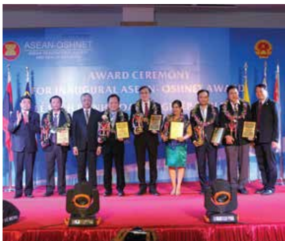
ASEAN-OSHNET Best Practices Award Winners receiving their awards on 27 April 2016 in Da Nang, Vietnam.

The next 15 years will be exciting times for the ASEAN-OSHNET as we move on to the next frontier. With the continued cooperation and support of all ASEAN Member States, international partners and tripartite partners, the obstacles of this bumpy journey ahead will definitely be easily overcome, as we chart and scale the next peak for the ASEAN-OSHNET.