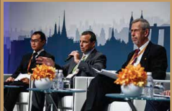
Business leaders and speakers from the ILO, IALI and EU-OSHA at the inaugural ASEAN-OSHNET Conference held in Singapore in May 2014.