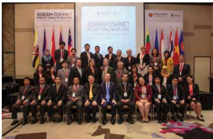
ASEAN-OSHNET Policy Dialogue 2016 in Singapore.