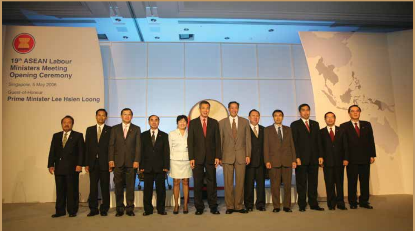
Singapore's Prime Minister, Mr. Lee Hsien Loong, with ASEAN Labour Ministers at the 19th ASEAN Labour Ministers Meeting in Singapore in May 2006.