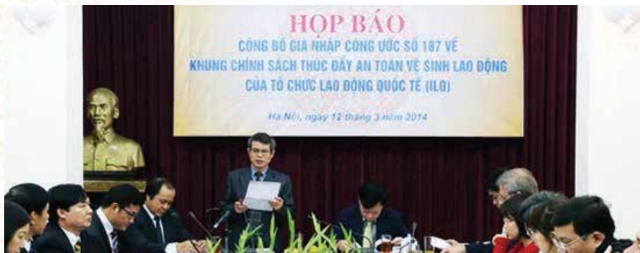
Head of MOLISA presenting the plan for implementing ILO Convention No. 187 in March 2014.

C187 aims at promoting a preventative safety and health culture and progressively achieving a safe and healthy working environment. This includes ratifying States committing themselves to continuous improvement of Occupational Safety and Health. This requires the development of a national policy, national system, and national programme on occupational safety and health through tripartism and social dialogue, in consultation with the most representative organisations of employers and workers.