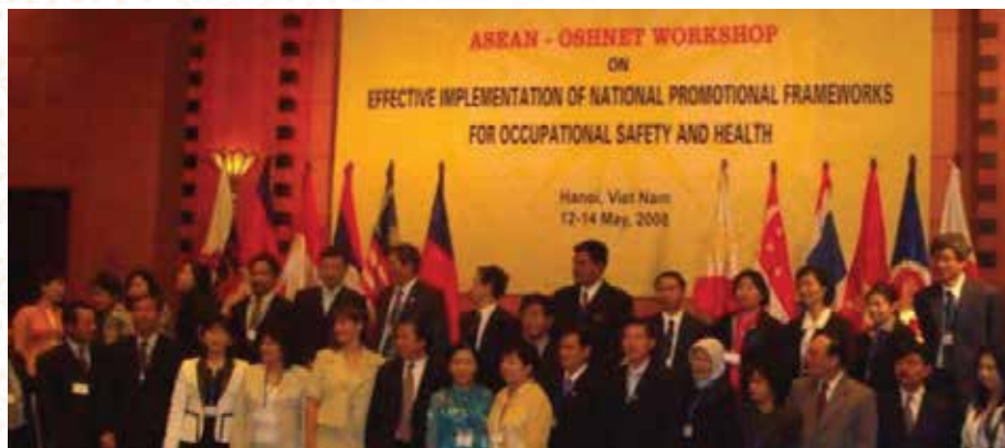
Participants of the ASEAN-OSHNET Workshop on Effective Implementation of National Promotional Frameworks for Occupational Safety and Health held in Hanoi, Vietnam, in May 2008.

With this goal in mind, the ASEAN-OSHNET held a policy dialogue on National Occupational Safety and Health Frameworks in Singapore in January 2007. At the dialogue, all ASEAN Member States agreed to set a target of developing a national Occupational Safety and Health profile and implementing national strategies and programmes by 2012.