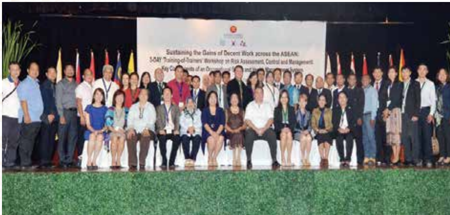
Group photo taken at the Training of Trainers Workshop on Risk Assessment, Control and Management in Quezon City, the Philippines, in February 2015.

The success of the ASEAN-OSHNET was partly due to its good relations with its partners, which continued till today. Throughout the years, the network greatly benefitted from the generous assistance of the Plus Three Countries and the ILO, which have been actively involved in the sharing of experiences and assisting ASEAN Member States in developing and implementing national Occupational Safety and Health frameworks.