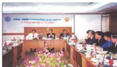
1 st CBM Bali, Indonesia Aug 2000