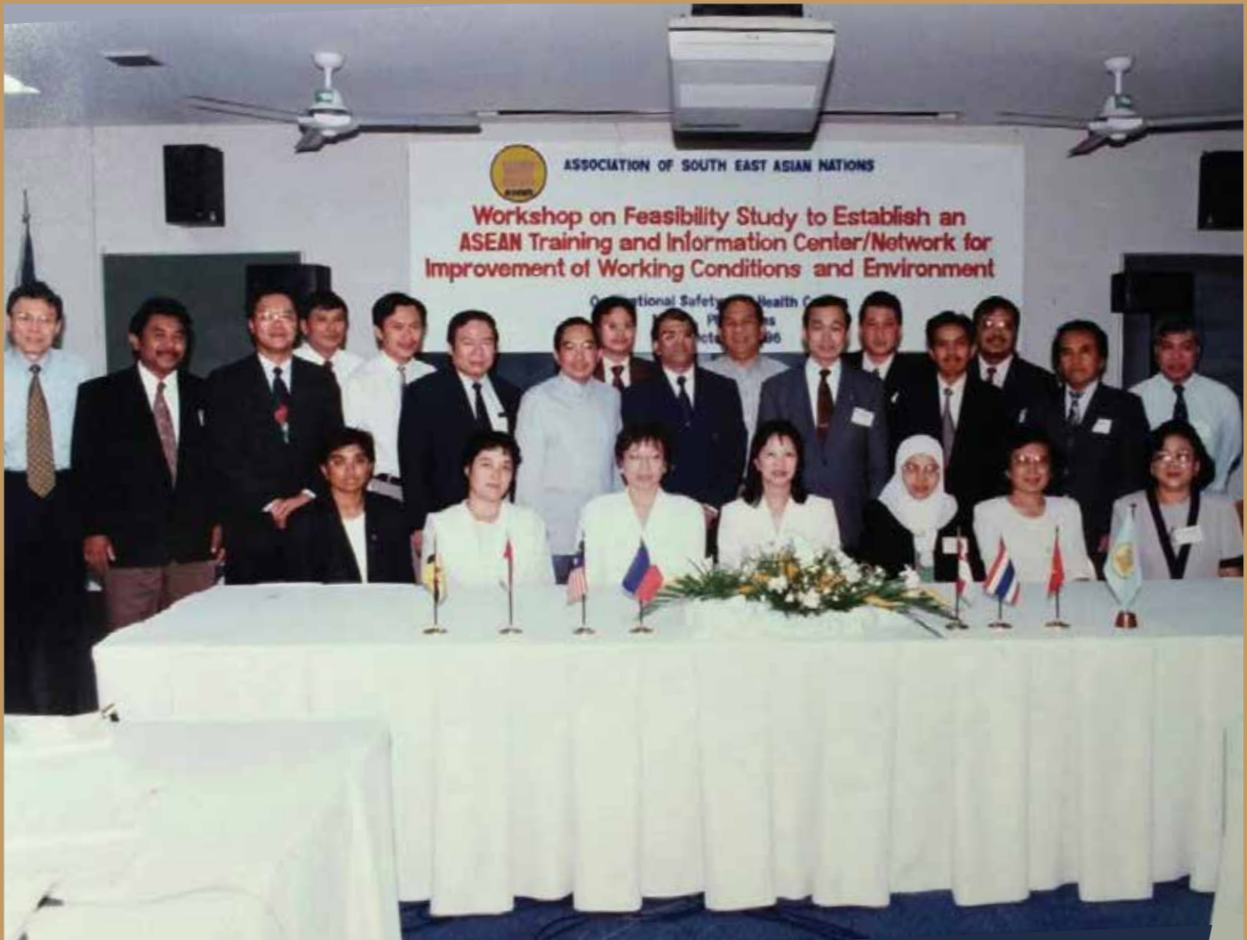
In October 1996, ASEAN Member States held a workshop on “Feasibility Study to Establish an ASEAN Training and Information Centre/ Network for Improvement of Working Conditions and Environment”.