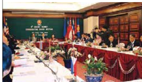
6 th CBM Ha Long, Vietnam March 2005